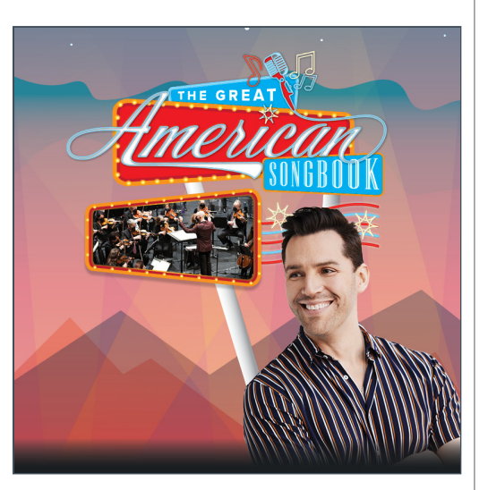
The Great American Songbook