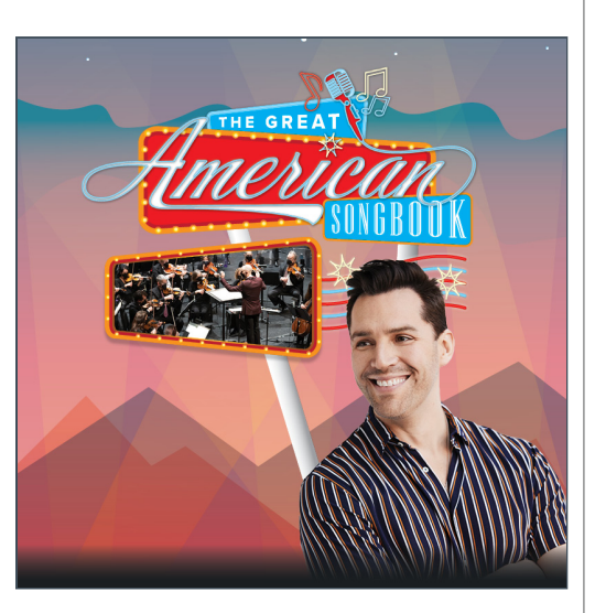
The Great American Songbook