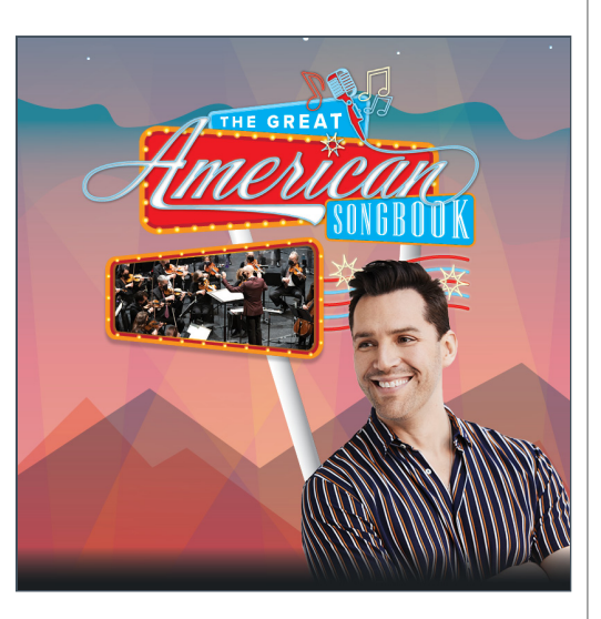
The Great American Songbook

The MSO is grateful for the generosity of the following donors who made tributes between February 27, 2022 through February 27, 2023.