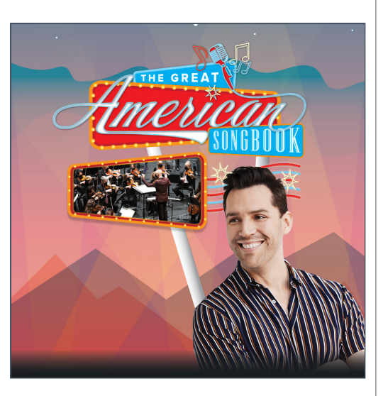
The Great American Songbook