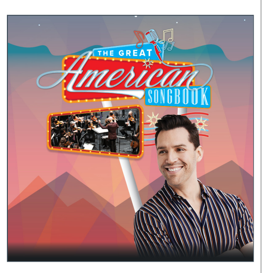
The Great American Songbook

became a fully professional orchestra in 1977. New innovations developed, such as pops concerts, the formation of the Modesto Symphony Youth Orchestra in 1976, and the first Picnic at the Pops in 1994. The 21st century marked further growth with the formation of the Modesto Symphony Orchestra Chorus in 2001, becoming a resident company of the Gallo Center for the Arts when their doors opened in 2007, and the creation of the Modesto Symphony Youth Chorus in 2017.