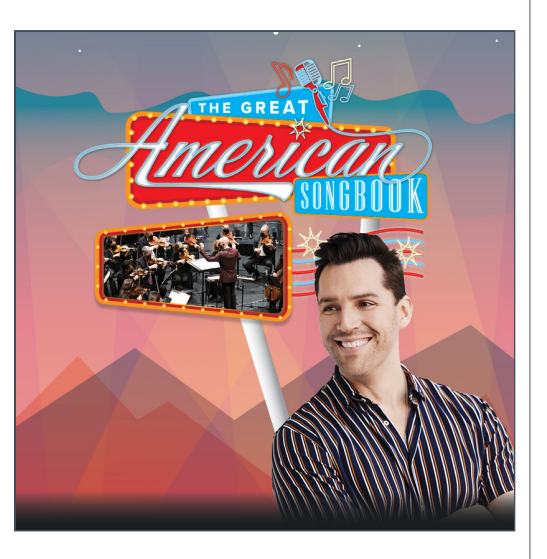
The Great American Songbook