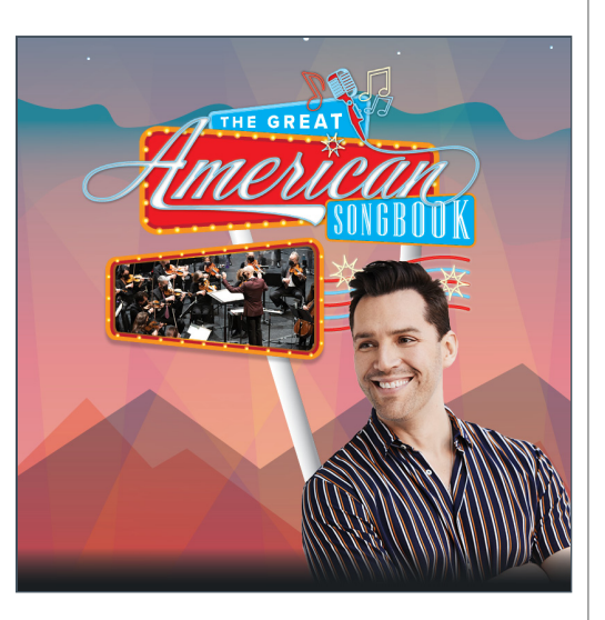
The Great American Songbook