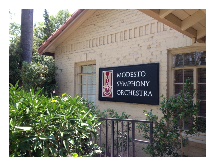
About the MSO